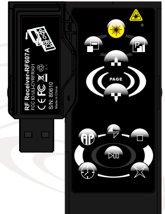
RC203 / 607